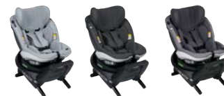
Peak Mesh Anthracite Mesh Metallic Mélange

Allows you to easily take your child in and out of the seat from any angle. We strongly recommend you to keep your child rear facing all the way to 105 cm, but it gives you the option of using it forward facing if needed.