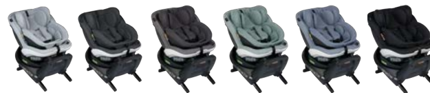
Peak Mesh Anthracite Mesh Metallic Mélange Sea Green Mélange Cloud Mélange Fresh Black Cab

Approved as especially back-friendly by the German association for healthier backs, Aktion Gesunder Rücken (AGR).