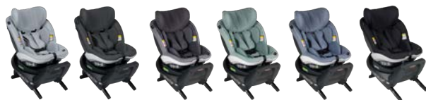
Peak Mesh Anthracite Mesh Metallic Mélange Sea Green Mélange Cloud Mélange Fresh Black Cab