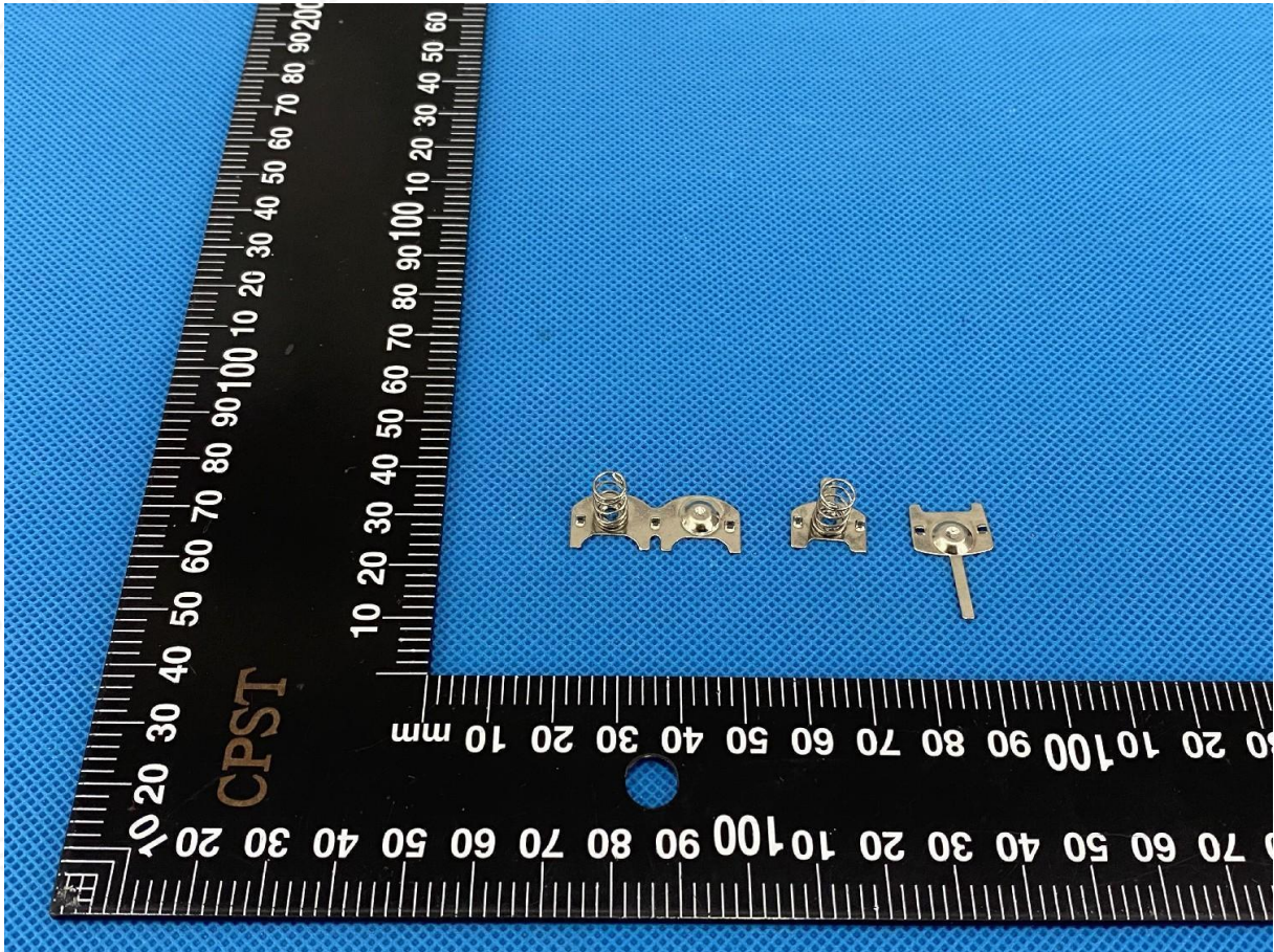
Photo of the Submitted Sample

Note: This Test report shall be invalid if it is not stamped with the special seal for testing. Only responsible for the tested samples, invalid if rewritten, added and deleted. This test report cannot be reproduced, except in full, without prior written permission of the Company. Any unauthorized alteration, forgery or falsification of the content or appearance of this report is unlawful and offenders may be prosecuted to the fullest extent of the law. Any demurral to the content of test report, please propose in 15 days after the report's sending out, it will not be accepted after this date.